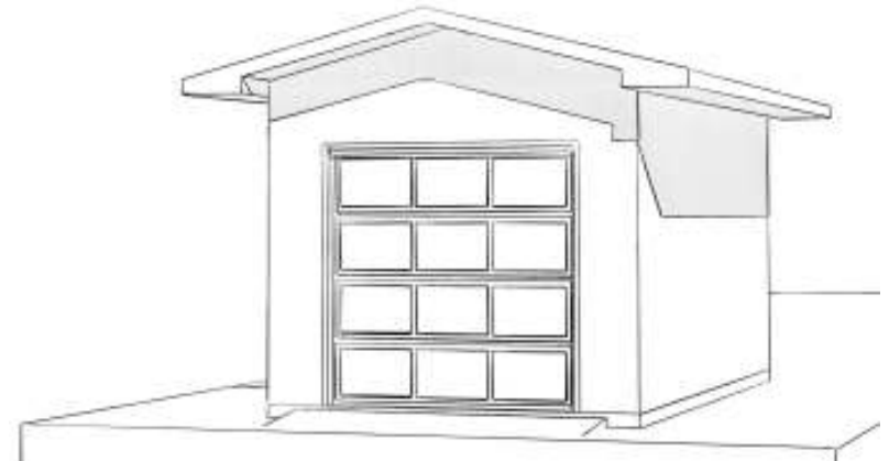
3 | GARAGE BACK SCALE 1' = 1'-0"