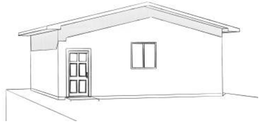
2 | GARAGE FRONT SCALE 1' = 1'-0"