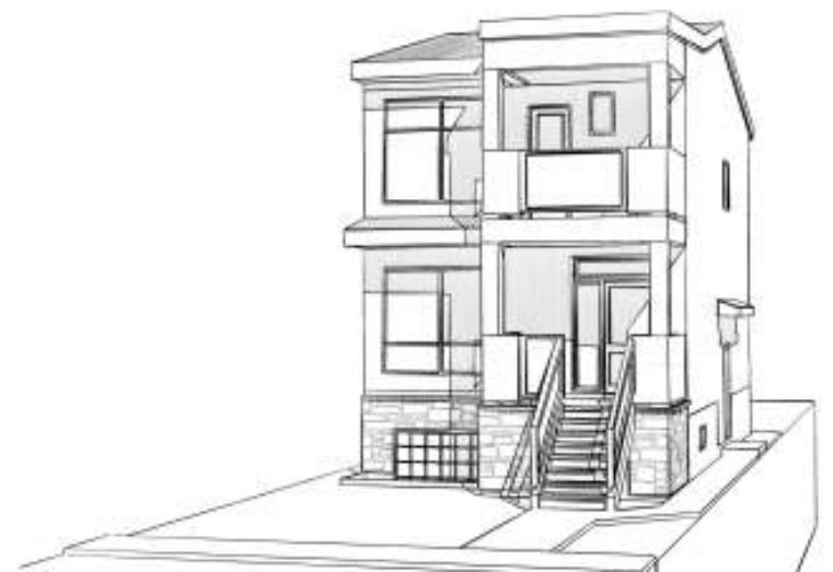
3 | 1407F FRONT SCALE 1' = 1'-0"