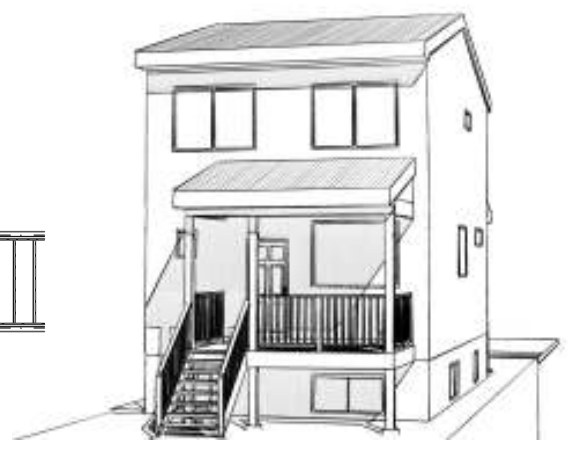
4 | 1407F BACK SCALE 1' = 1'-0"